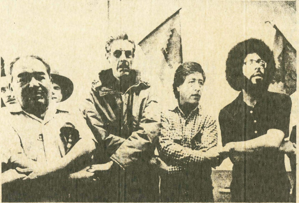
UFW SIT-IN — United Farm Workers President Cesar Chavez (in checkered shirt) links hands with supporters during a demonstration Wednesday at the state Agricultural Labor Relations Board office in San

Diego. The mass arrests of union picketers by California State Police in El Centro Tuesday touched off demonstrations throughout the state.