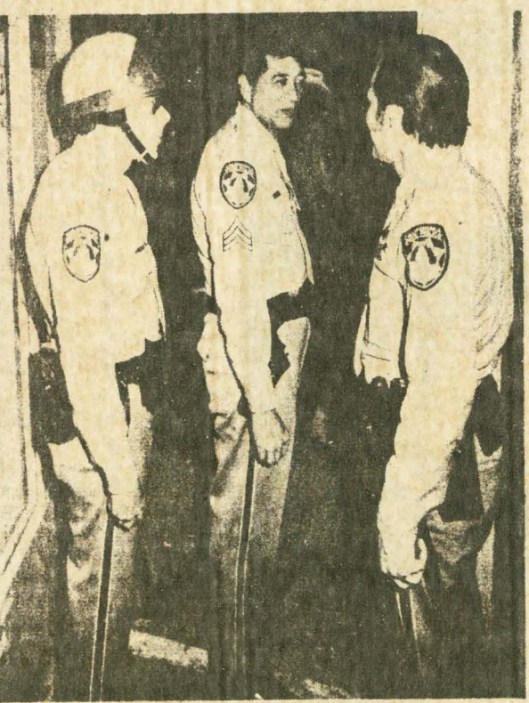
STATE POLICE — Three of the six California state police officers ordered to the ALRB office Tuesday, continued to stand guard Wednesday. The special police expect to leave tonight.

the demonstrators came inside the office and allegedly physically and verbally abused the workers.