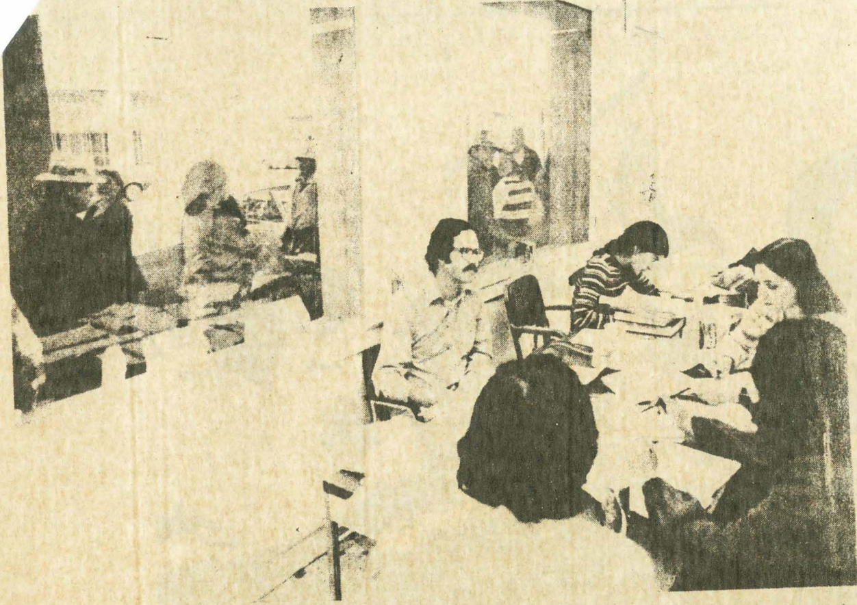
UNDER PRESSURE — ALRB employes try to go about their business Wednesday while about 70 UFW supporters picket outside. On Monday and Tuesday,

the demonstrators came inside the office and allegedly physically and verbally abused the workers.